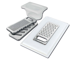
Graters kit with ring-holder and food collection tray 8159 101 * only in combination with the accessory 8644 101